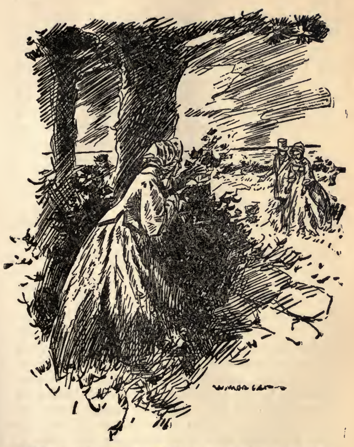
"Rising to peer over the bushes at the minister and Grace."